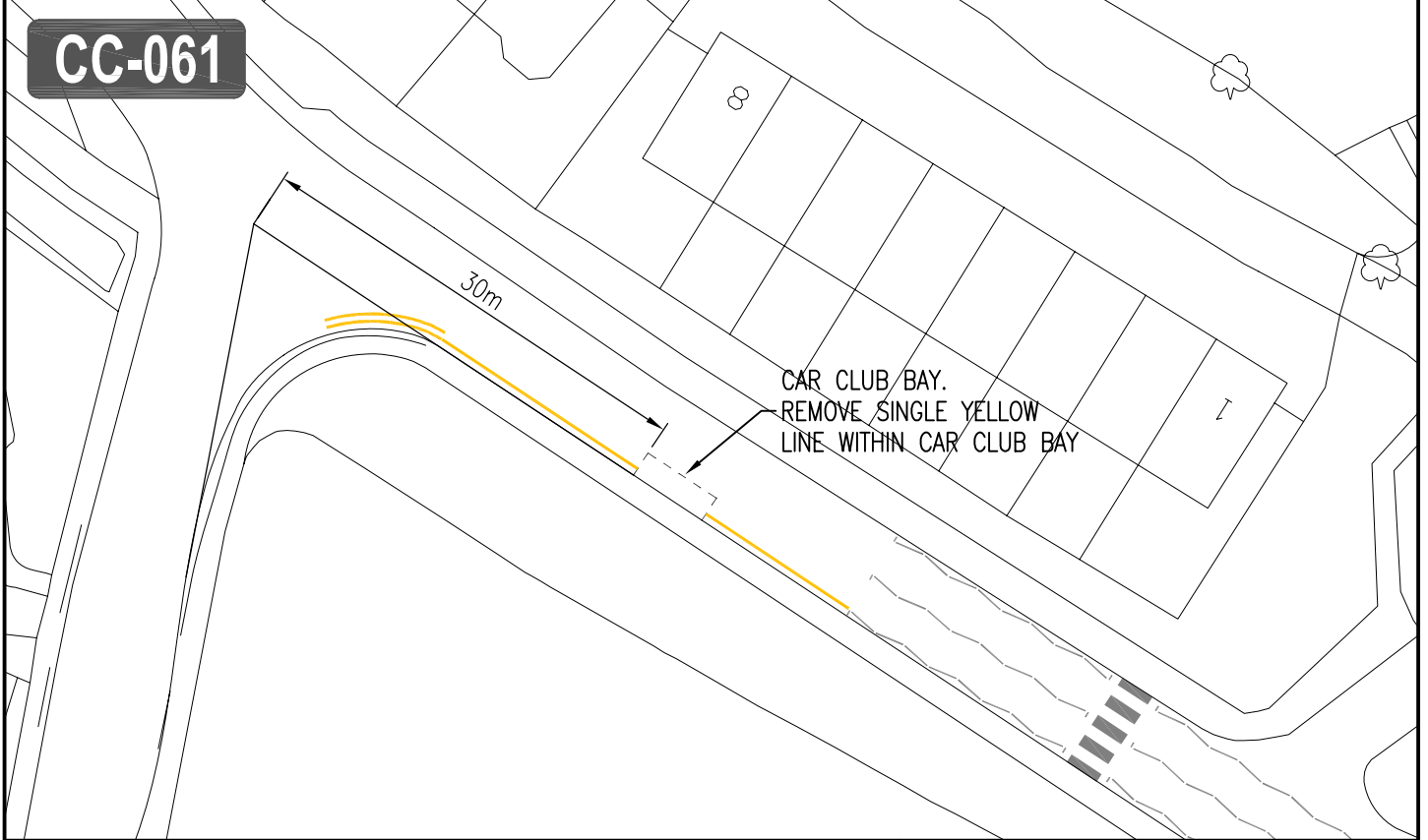
DETAIL PLAN - SCALE 1:500