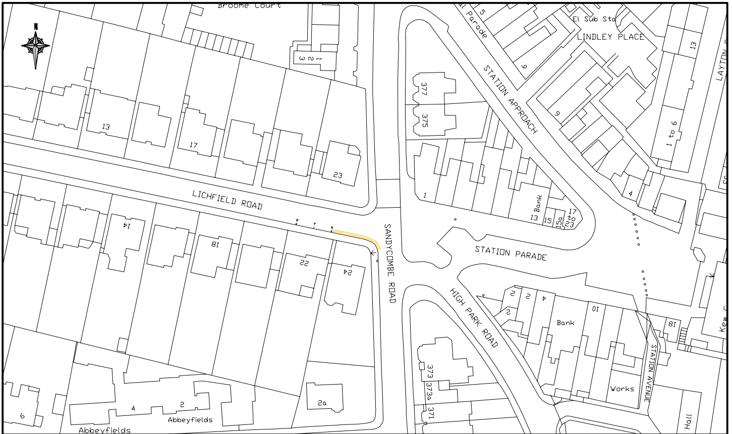
LOCATION PLAN—SCALE 1:1250