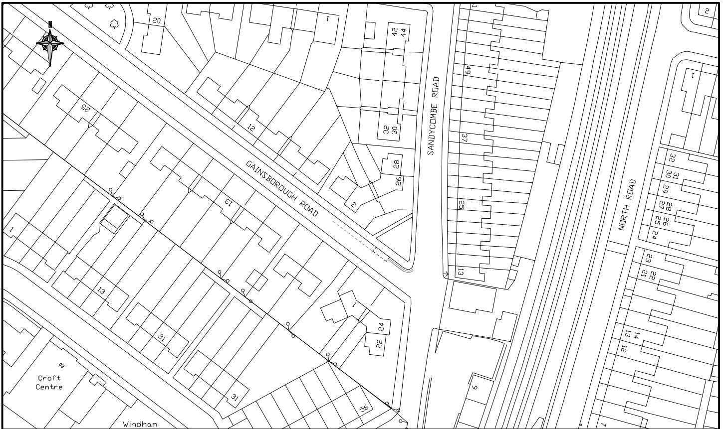
LOCATION PLAN - SCALE 1:1250