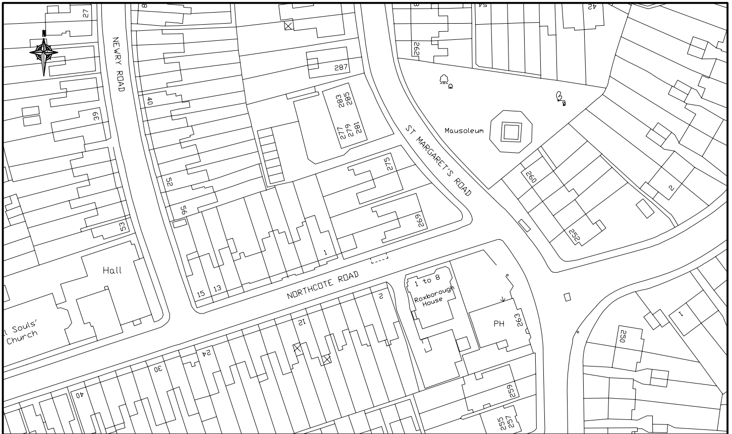
LOCATION PLAN—SCALE 1:1250