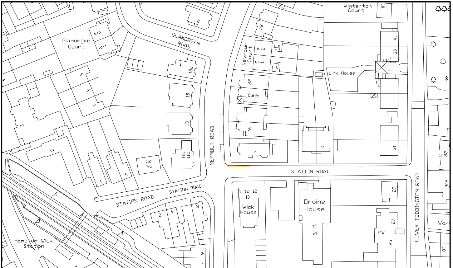
LOCATION PLAN-SCALE 1:1250