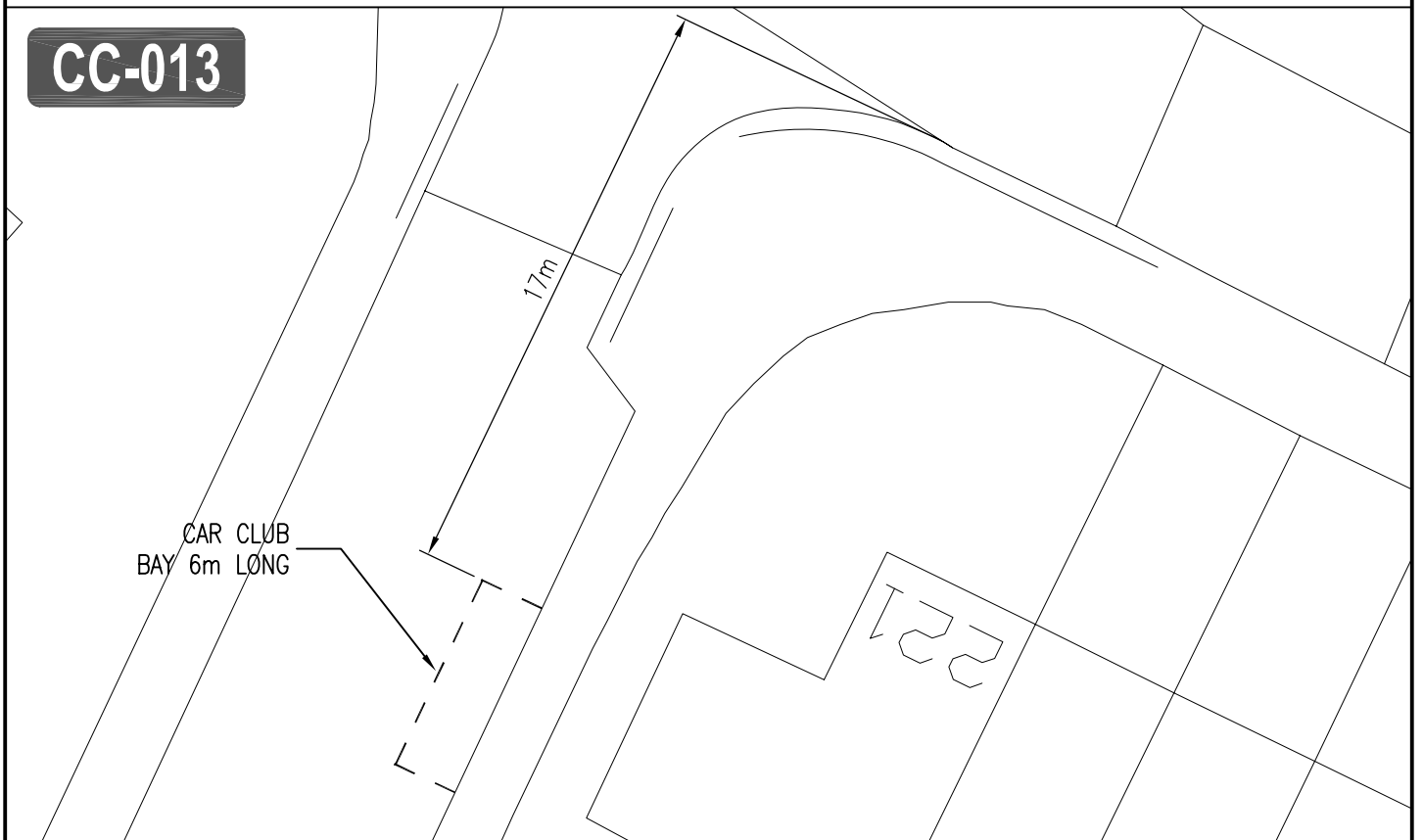
DETAIL PLAN – SCALE 1:200