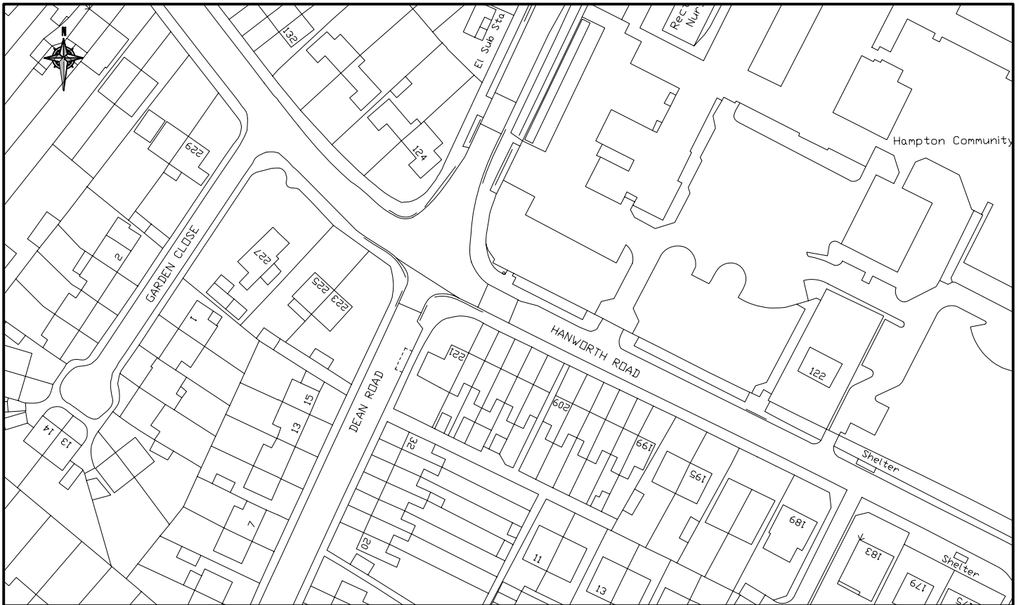
LOCATION PLAN—SCALE 1:1250