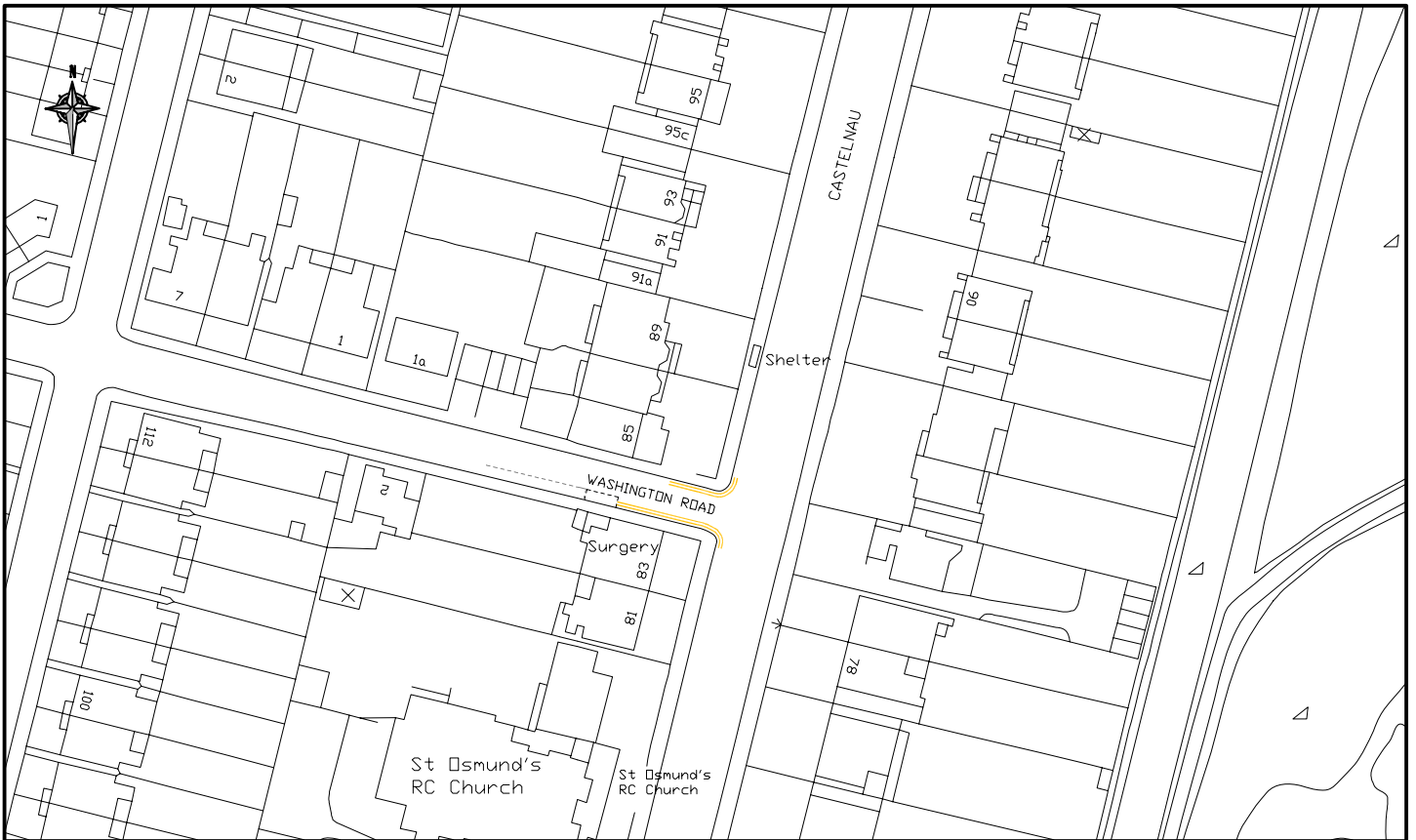
LOCATION PLAN-SCALE 1:1250