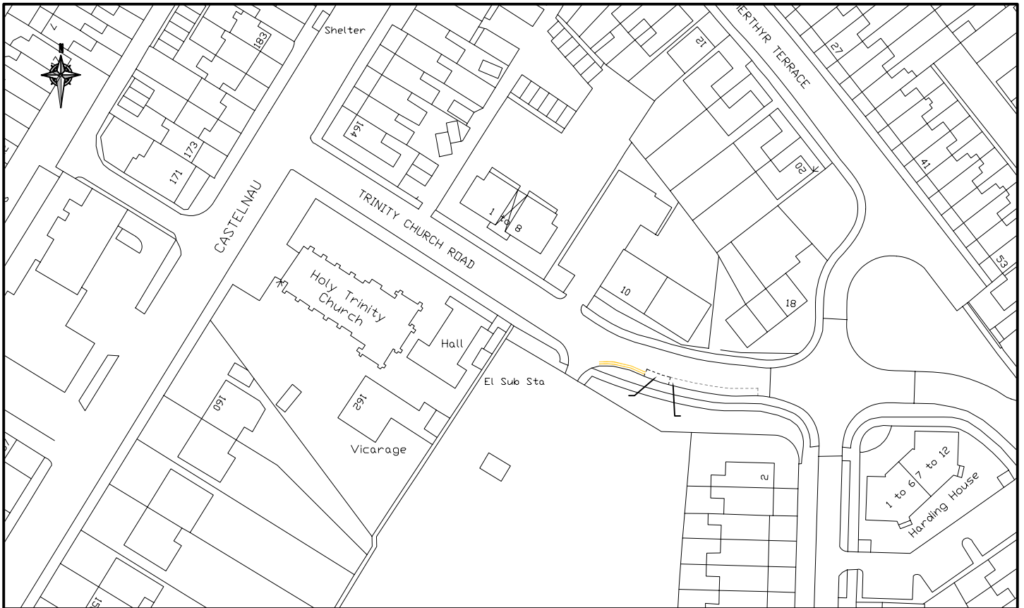
LOCATION PLAN—SCALE 1:1250