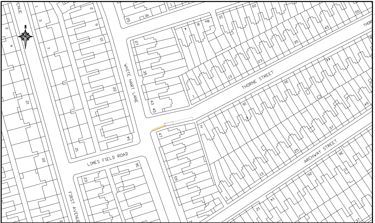
LOCATION PLAN-SCALE 1:1250