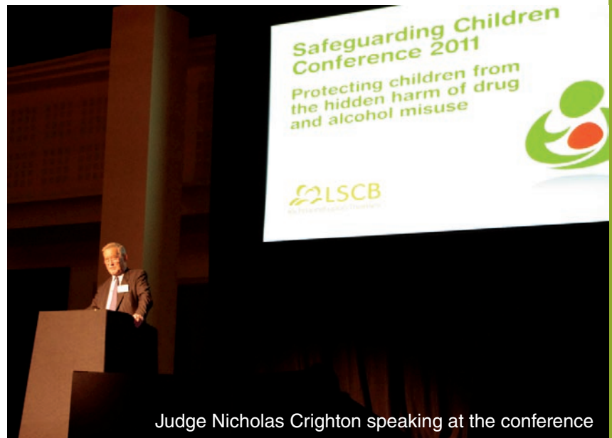
Judge Nicholas Crighton speaking at the conference

You can download conference presentations from the LSCB website .