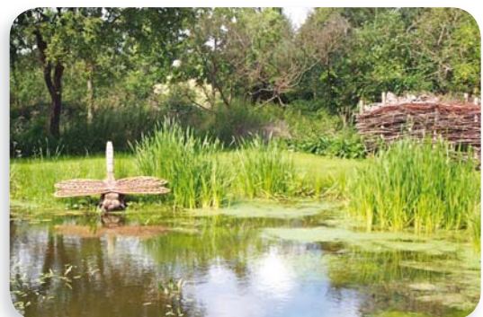
Kew Gardens Wildlife Pond

For more information about the NERC Act see http://www.london.gov.uk/gla/publications/environment/dutybound.pdf or ring the Parks Department at Richmond Council on 08456 122 660.