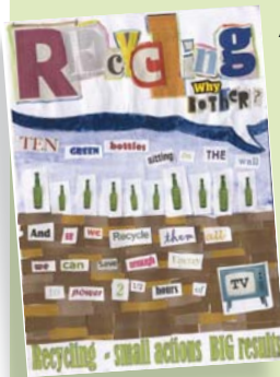
design a poster for national use

As we head towards a BREEAM excellent school and in the spirit of using BSF for educational opportunities, one of our students has won a national competition to