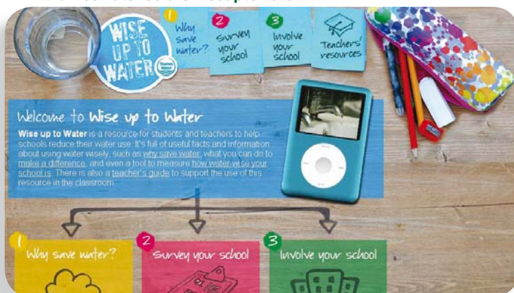
Water Wise website

To view the film and find out more about saving water at school, visit www.thameswater.co.uk/wiseuptowater .