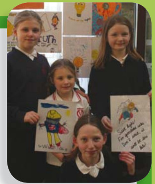
The Winners of the Energy Saving Poster Competition