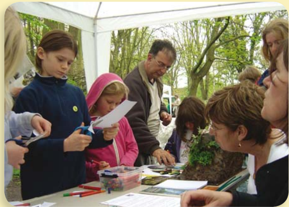
Families enjoying Springtime Safari 2008

The Springtime Safari is a partnership project of LBRuT Arts Service, Richmond Environment Network and the Richmond Biodiversity Group.