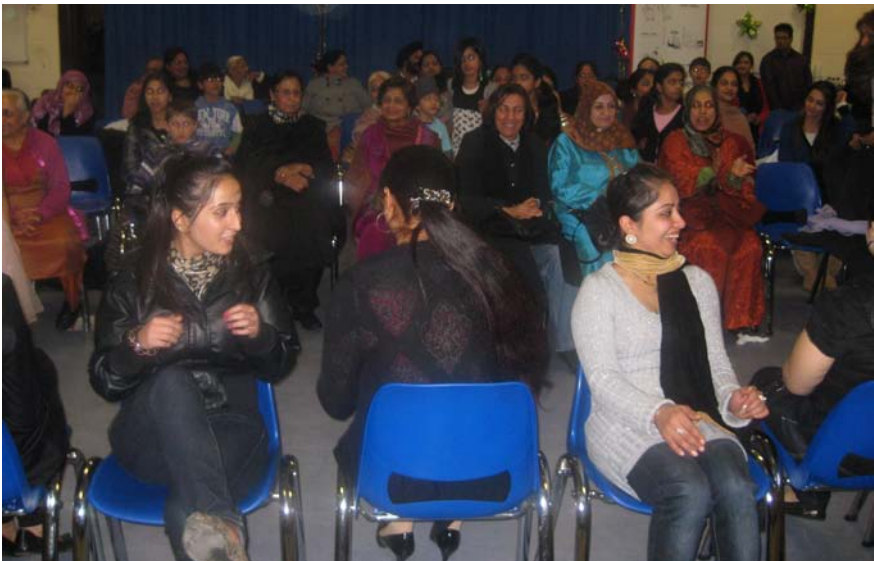
Multicultural celebration at Hounslow Heath estate in December 2010

The group is independent of the local authority and the police, although the Council's Chief Executive acts as its Honorary Clerk.