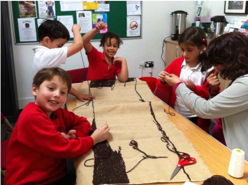
Young people enjoying an EMAG "chat and stitch" session

We organised 22 sessions over the last 12 months for members of the Group. They included sessions on health and