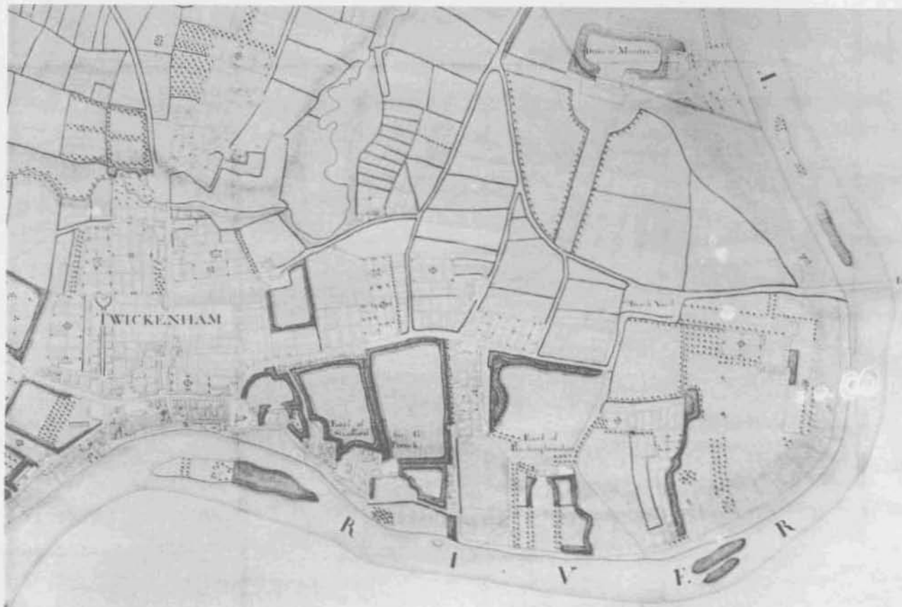
C.J. Sauthier's map of Isleworth & Sion 1786-7

The land that became Beresford Avenue was open land until the houses that now form the conservation area were constructed. The area once formed part of the Twickenham Park estate, as shown in the maps of John Rocque dated 1741-45 and C J Sauthier of Isleworth and Sion dated 1786-7. The enclosure map of 1818 shows the division of the park land which led to a number of housing developments from the mid nineteenth century; houses were constructed along Richmond Road to the south and Park Road was extended to the north. This left a rectangular piece of open ground from the older section of Park Road in the west to the river in the east, interrupted by a footpath. By 1894 the footpath had been upgraded to a road with a line of trees flanking its west side, and named Willoughby Road. The land was used for grazing and in 1908 was known as Home Farm. The death of the owner Josiah Clarke in 1920 led to its sale for use as a sports ground. By the time Beresford Avenue was built on this land in 1935, all the surrounding land had already been swallowed up by housing development.