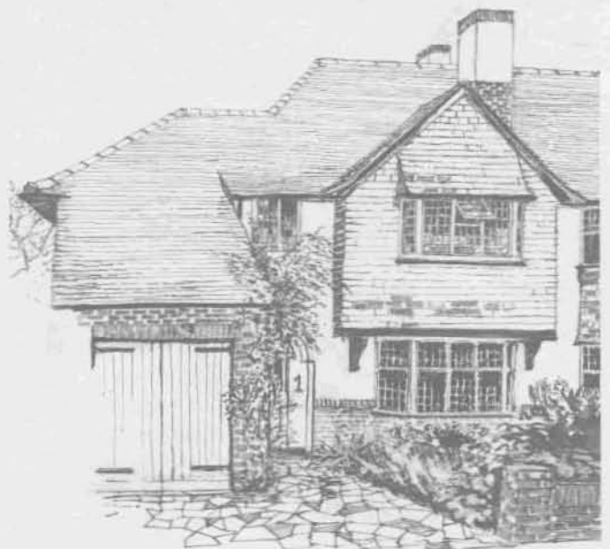
No. 1 Beresford Avenue

The Council is able to control new development through its powers under the Planning Acts. Where a particularly good group of houses would suffer if 'permitted development' (work exempt from planning permission, as described above) were to be carried out, the Council may apply an Article 4(2) Direction after consultation with the owners. Such a Direction means that some 'permitted development' rights specified in the Direction, involving minor alterations to the exterior of a single family house, are withdrawn, and owners must apply for planning permission to carry out the intended work. A Direction has been made in this conservation area, of which details are given in the following section. The detailed guidance is intended to help owners considering alterations which may be covered by the Direction.