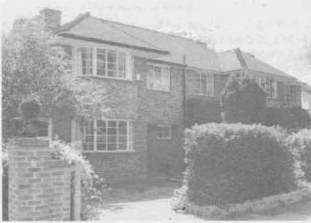
Nos. 4 & 2 Beresford Avenue

characteristic 1920s/1930s 'sunburst' design in gates, and the original form of front boundary was probably metal posts with link chains. The naming of the street as an 'avenue' emphasises the importance of the street trees' contribution to the development, culminating in the mature trees which now enclose the east end of the conservation area at Duck's Walk.