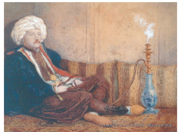
Richard Dadd (1817-1886) Portrait of Sir Thomas Phillips in Turkish Dress, 1842/3 Watercolour on paper, 17.4 x 25.3 cm. LDBTH 774.

whose new book, Richard Dadd: The Artist and the Asylum, will be published in July, says that while Dadd's story presents "a fascinating case study in the history of psychiatry", trying to find manifestations of his illnesses in the paintings is a futile exercise.