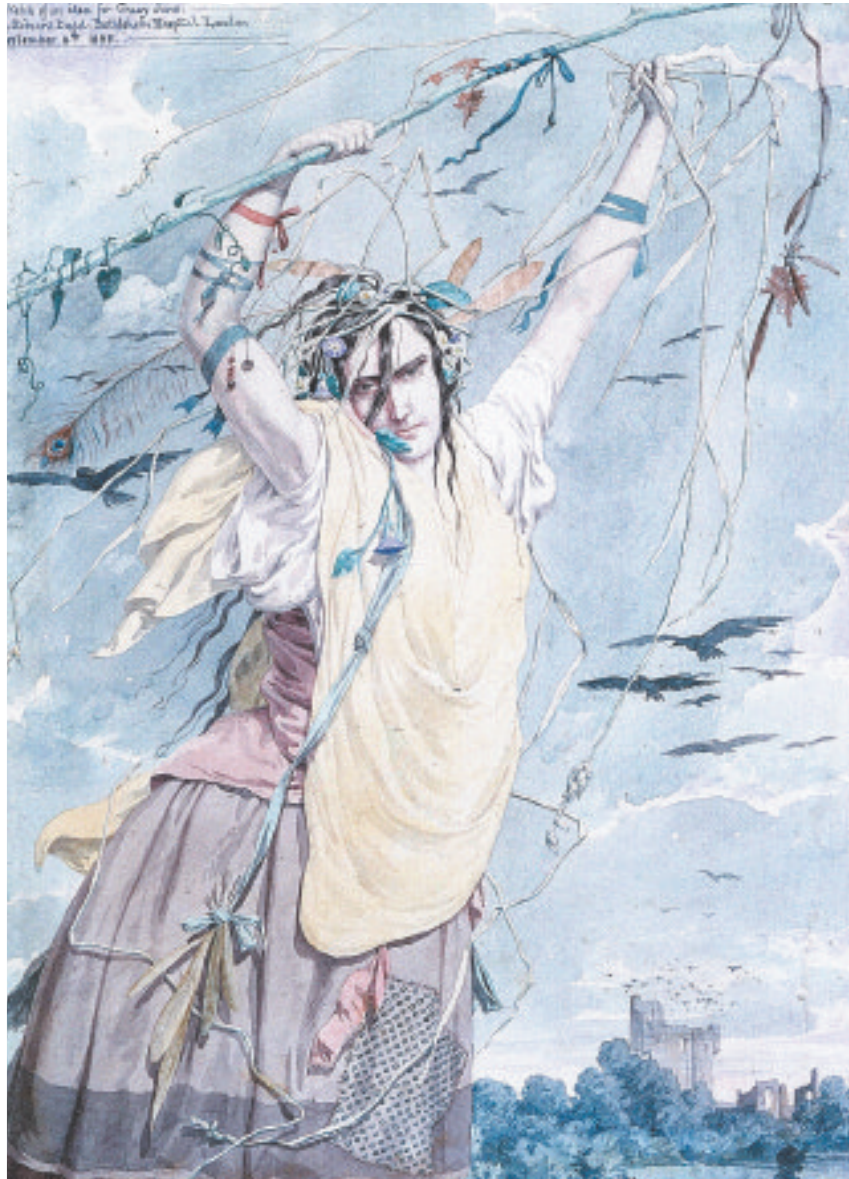
Richard Dadd (1817-1886) Sketch of an Idea for Crazy Jane, 1855. Watercolour on paper 35.5 x 25.4 cm. LDBTH 209.