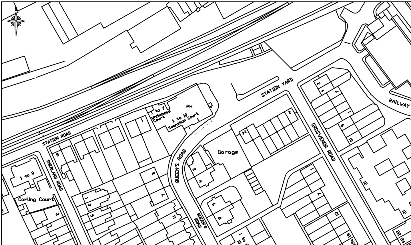
LOCATION PLAN - SCALE 1:1250