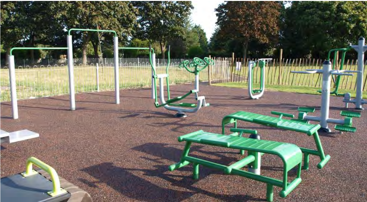
Refurbished outdoor gym