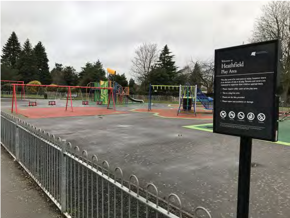
Formal play area

The formal playground is in good condition and has appropriate signage. The natural play area dates to the Playbuilder project in 2010 and is currently undergoing a refresh. A rope bridge over the mounded area has now been removed and plans to replace it this year with natural climbing items are under discussion with the Friends group.