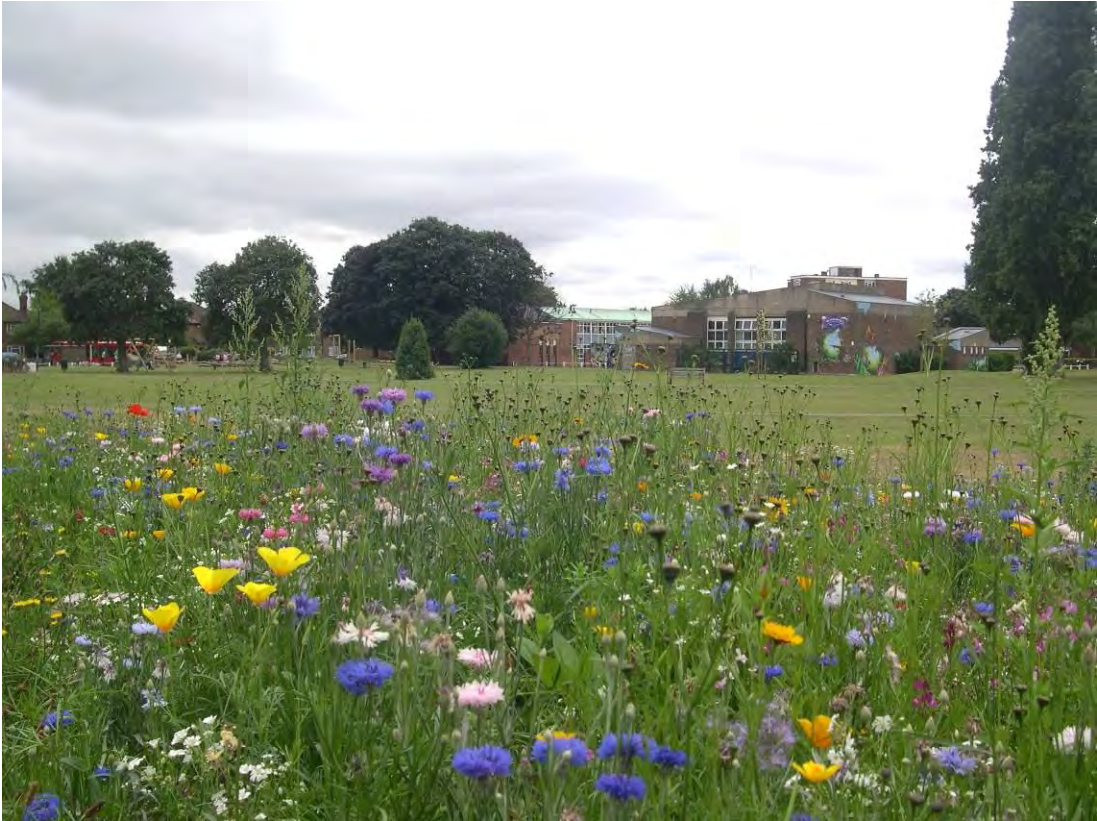
Photo of the wildflower meadow

Foxes have been seen on-site as well as a variety of birds including a woodpecker which has made the Green its home. Following a survey, bats have also been found to use the trees and vegetation along Wiggins Lanes as part of a flight corridor.