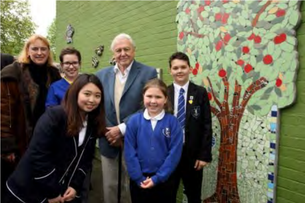
Sir David Attenborough official unveiling of the mosaic in 2014

“I have to say I live up on Richmond Hill and we are lucky aren’t we being in one of the glorious spots of London and if it is to remain one of the greatest spots of London it is because you care about it and say something about it and put people in office who will do something about it. So, it is to your credit that this is as lovely as it is and to your credit that it goes on being as lovely as it is.”