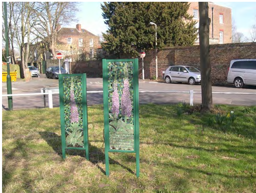
Poets corner mosaic