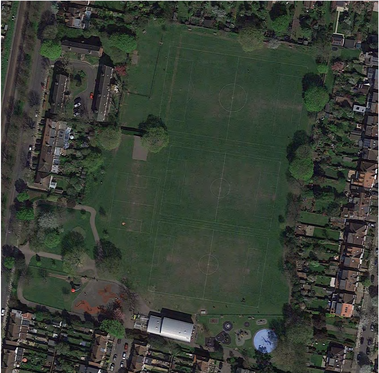
Map 3: aerial photo of North Sheen Rec