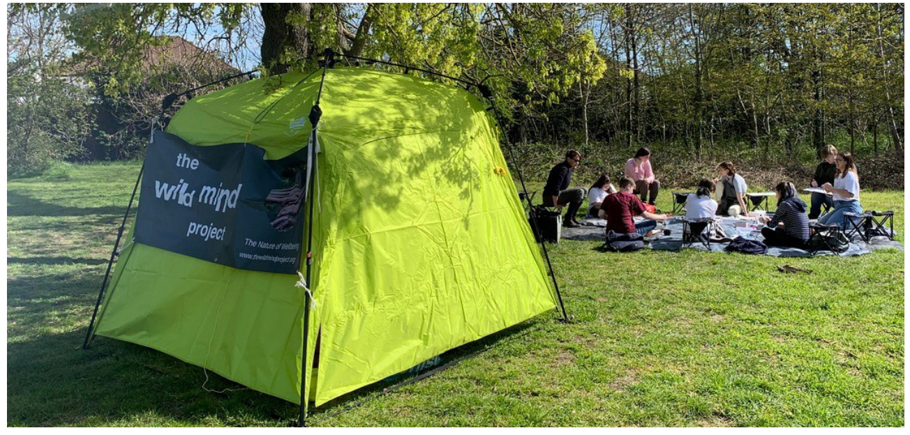
The Wild Mind Project - Nature-based creative activities