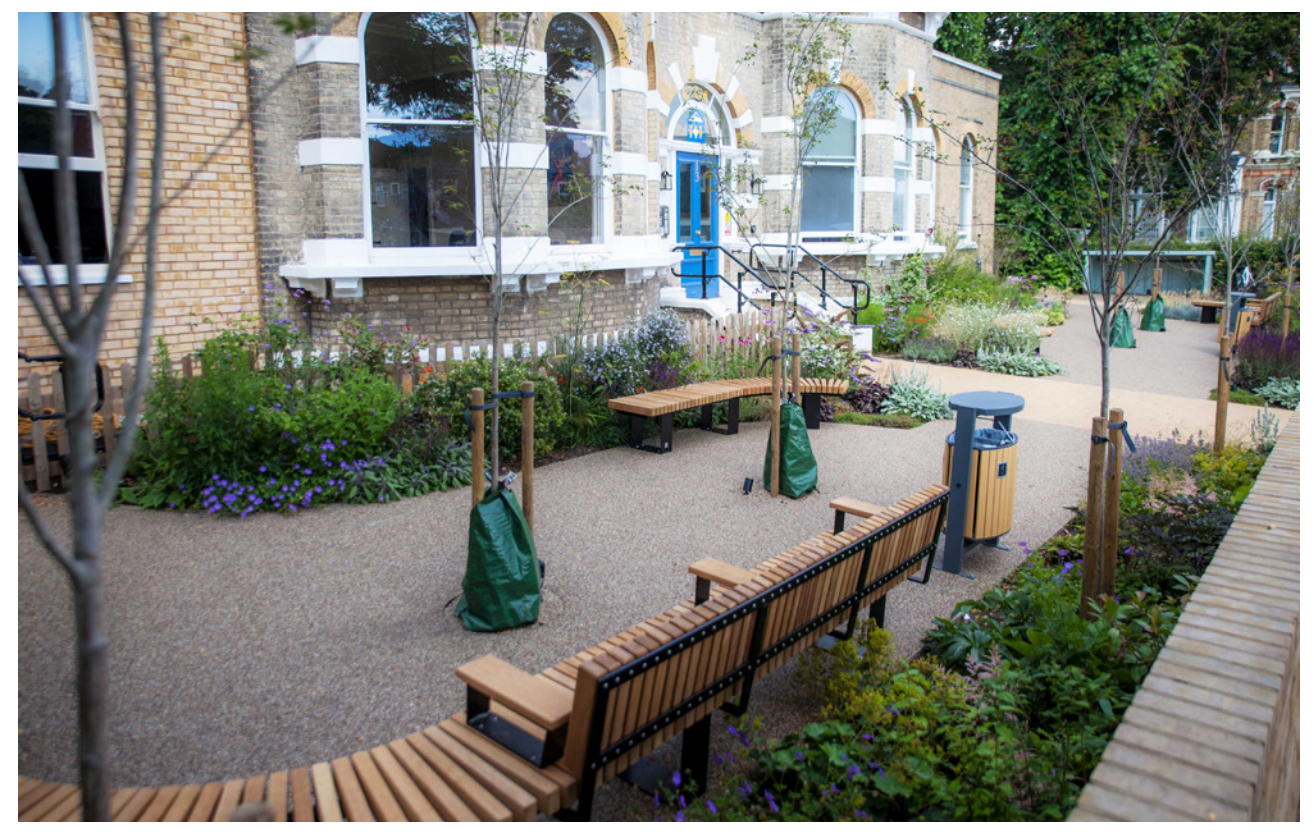
ETNA Community Centre - Sensory Garden