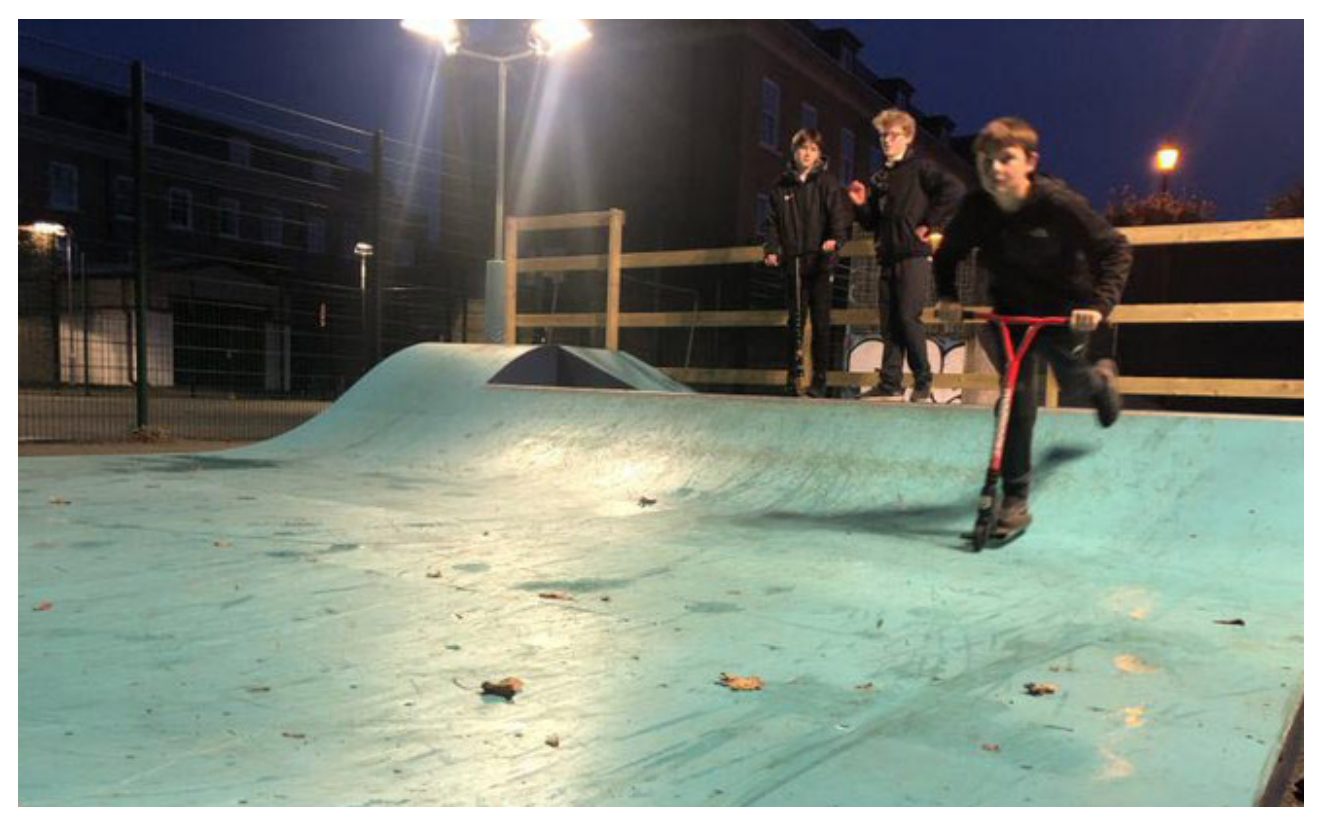
Heatham House Skate Park

Beneficiaries – older people and people living with disabilities living in Whitton.