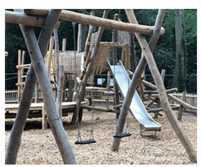
East Sheen Common Play area