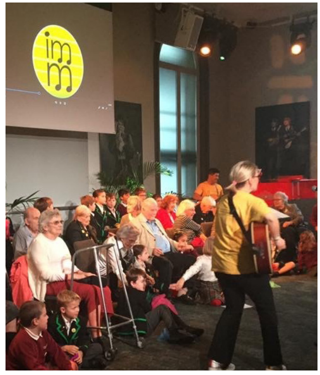
Intergenerational Music Making - Connecting through the years community hub