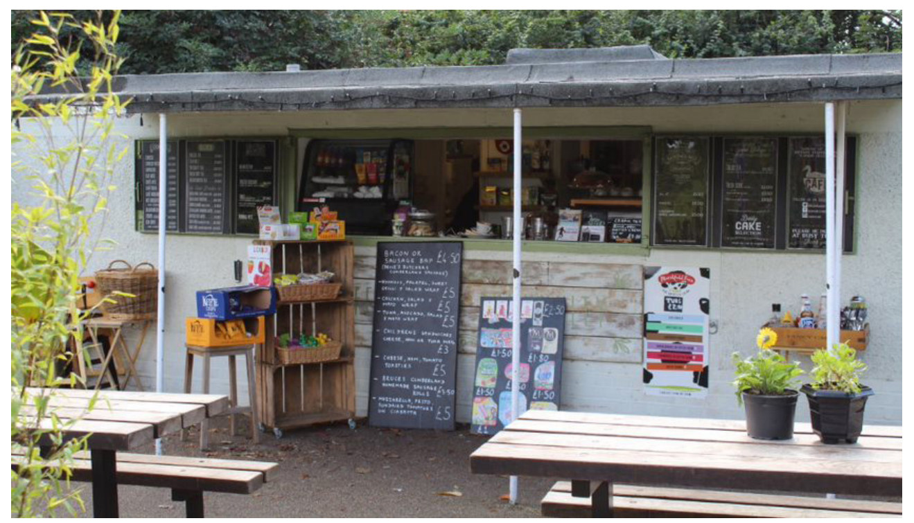
Radnor Gardens Café