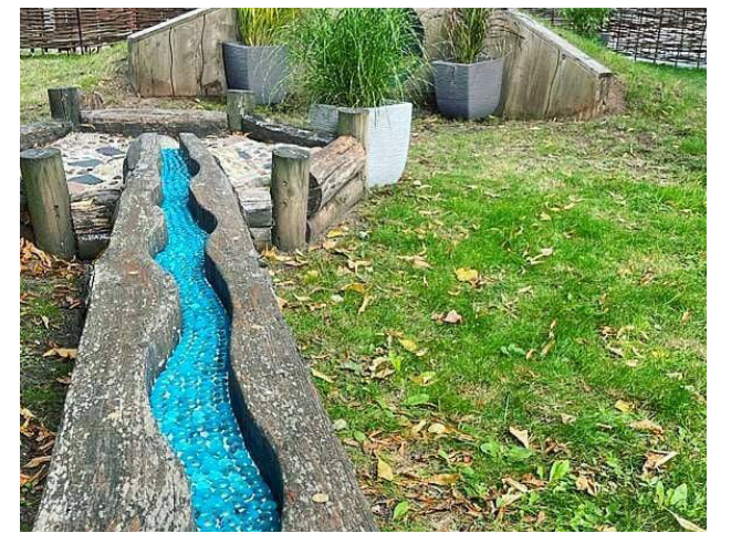
The Purple Elephant Project - Play Therapy Garden