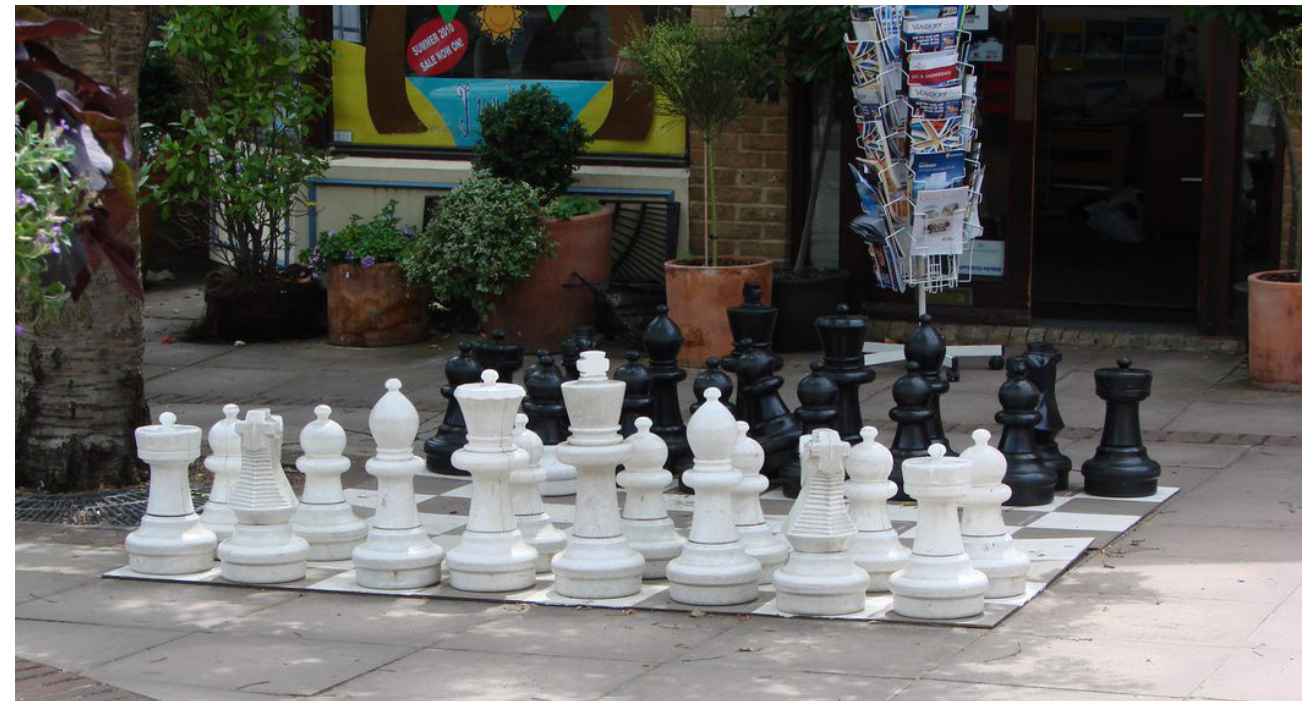
Church Street Chess set