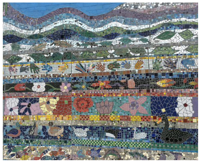
Ham Street Mural