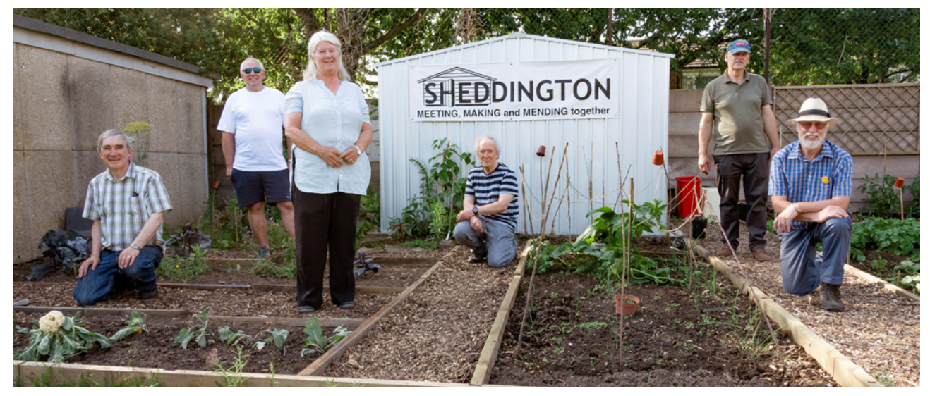
Sheddington - Community Shed