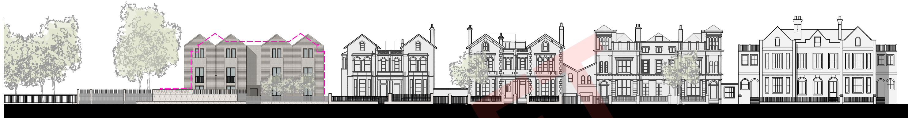
South elevation - 1:400@A3