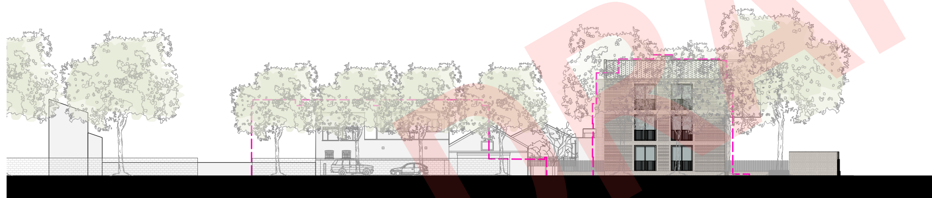
West elevation - 1:400@A3